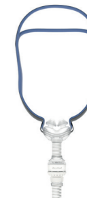
AirFit™P10 for AirMini