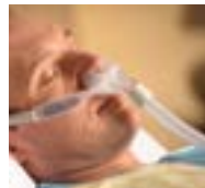
Nuance and Nuance Pro pillows mask