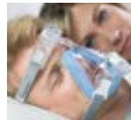
AmaraGel full face mask