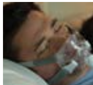
AmaraView full face mask