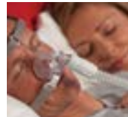
Pico nasal mask