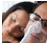
Wisp nasal mask