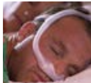
DreamWear under the nose nasal mask

With innovative cushion designs for excellent seal and comfort, our Philips Respironics masks are helping CPAP users get the sleep they deserve.